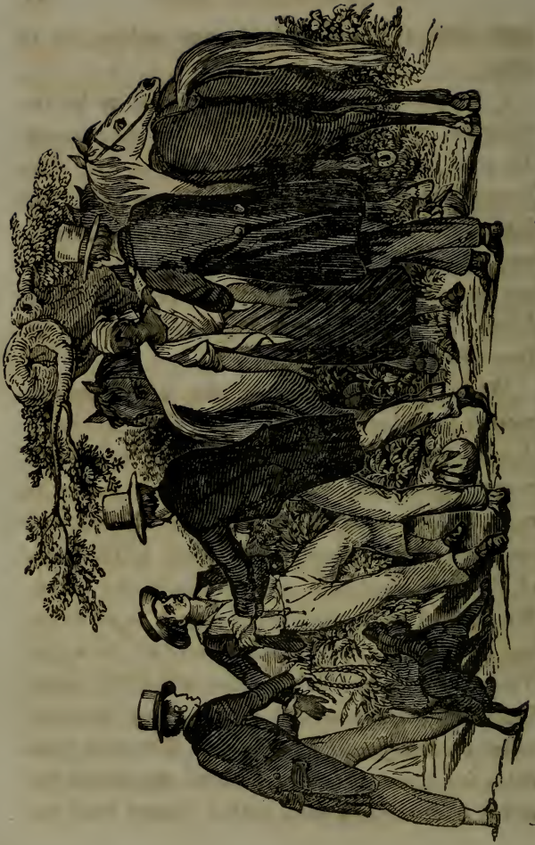
The author and his mother arrested and carried back into slavery.